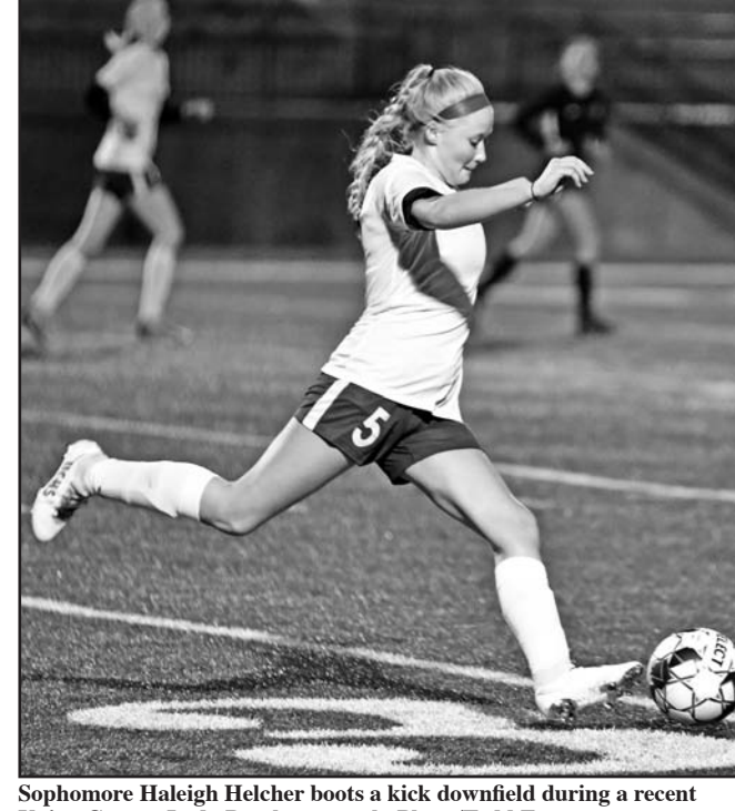
Union County Lady Panthers match.